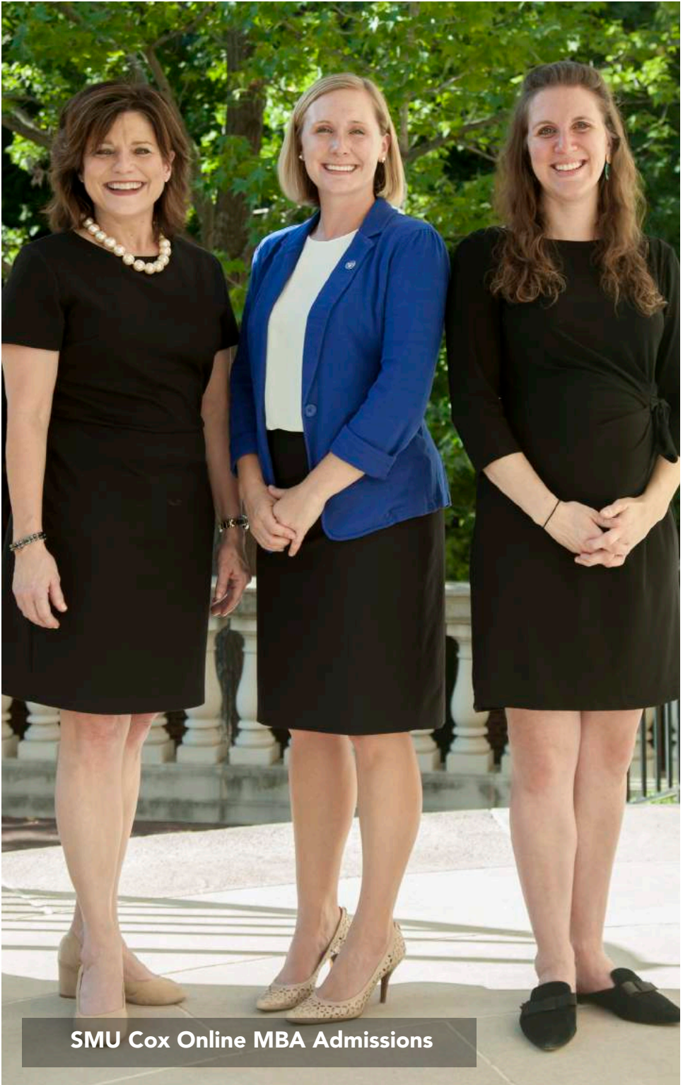
SMU Cox Online MBA Admissions